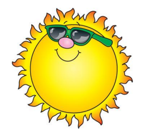
It's Activities Week!